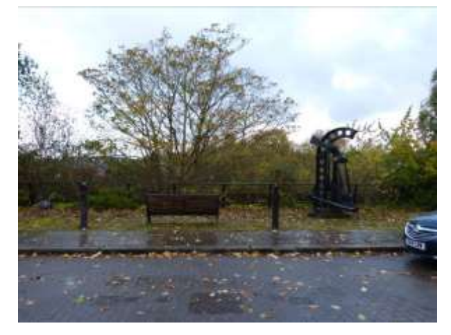
Features of an earlier public realm scheme on Old Barton Road, which are now redundant due to the overgrown embankment vegetation