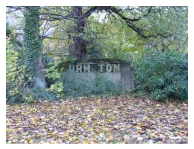
The Urmston sign, which is in need of repair

2.4.4 Clearing the excess vegetation growth will also re-expose the Urmston sign which greets pedestrians and cars crossing the bridge from the north. Although modern, this feature helps create a sense of place so should be retained, cleaned and repaired.