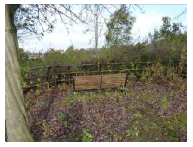
Overgrown but stylistically appropriate railings on Old Barton Road

2.3.3 There is evidence that the now-derelict houses on Chapel Place once had traditional front boundaries formed of upright slabs of roughly-hewn local masonry, which is typical of much of the Trafford area. These should be repaired and fully reinstated where possible and where there is no conflict with consented development proposals. The Redclyffe Road boundary walls of All Saints Church are of similar, roughly-hewn local masonry which is very heavily stained and would benefit from cleaning.