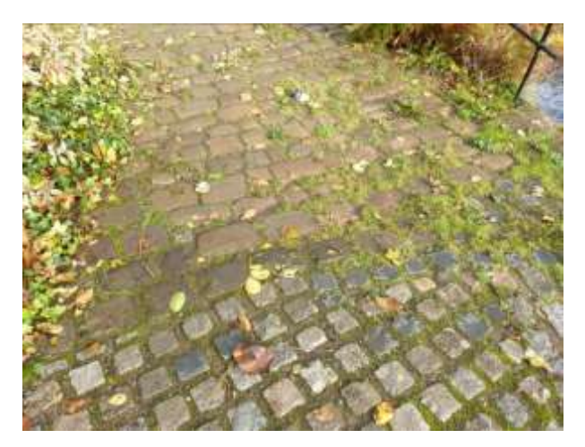
Historic cobbles and modern setts

2.4.7 With regards to the surface treatments, there are historic cobbles which survive in a good condition along part of the Bridgewater Canal and these should be retained and cared for where possible. Cobbles and modern square masonry setts extend further on to Chapel Place and are an appropriate surface treatment. Along Old Barton Road some of the roughly-hewn masonry slabs forming the surface of the pavement have been lost and replaced with standard tarmacadam. These should be reinstated.