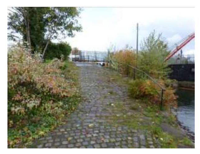
The municipal handrail along the Bridgewater Canal, with the safety fence on the far right

2.3.2 The more municipal style boundary treatments along the Bridgewater Canal – the plain black municipal handrail, white-painted bollards and standard safety fence – are incongruous and bear no relation to the boundary treatments in the western part of the Conservation Area. If possible to implement the rationalisation of a boundary treatment scheme along the two canals in particular would unify these two spaces. The railings established on the west side of Old Barton Road would be an appropriate option.