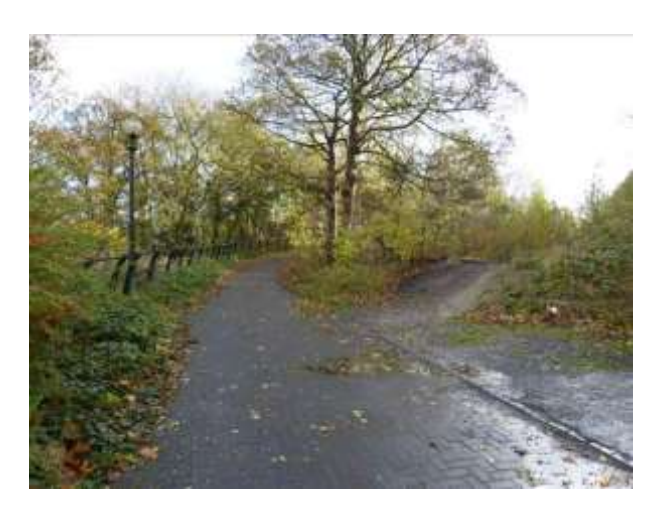
Lamp posts on Chapel Place

2.4.8 It is evident that a lighting scheme was introduced at some point in recent decades on Chapel Place and along Old Barton Road. This is stylistically appropriate and more attractive than the standard municipal lamp posts further up Redclyffe Road. Extending the scheme and ensuring the bulbs are all working will help alleviate the neglected air of the Conservation Area.