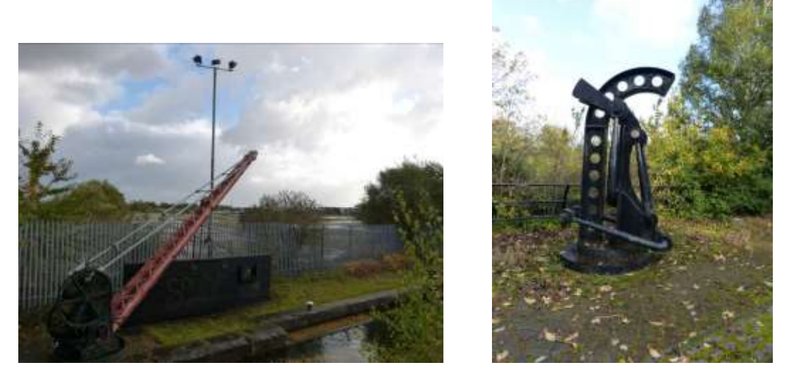
Canal-side features which should be explained in the interpretation scheme

2.4.5 The introduction of interpretation along the edge of the canal is also strongly recommended as a means of conveying the history and significance of the Conservation Area and Manchester's industrial heritage in general to the public. The aforementioned platform could be a good location for this as views of the swing bridge would be clearly visible once the overgrowing embankment was cleared and kept in a better condition. Interpretation should incorporate the surviving industrial features such as the crane on the east side of the Bridgewater Canal and the installation on Old Barton Road.