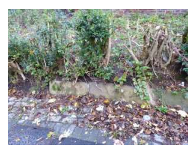
Boundary treatment in front of the derelict houses on Chapel Place