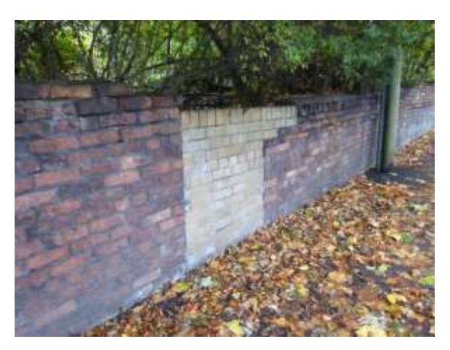
Inappropriate repairs to a historic brick boundary wall

2.3.2 The more municipal style boundary treatments along the Bridgewater Canal – the plain black municipal handrail, white-painted bollards and standard safety fence – are incongruous and bear no relation to the boundary treatments in the western part of the Conservation Area. If possible to implement the rationalisation of a boundary treatment scheme along the two canals in particular would unify these two spaces. The railings established on the west side of Old Barton Road would be an appropriate option.